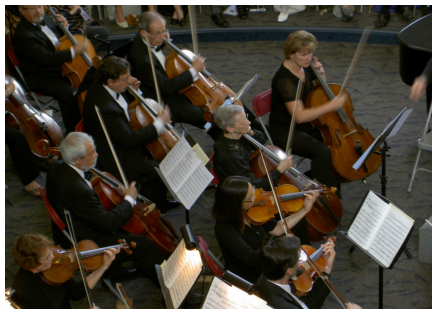
CBSO, at the rotunda